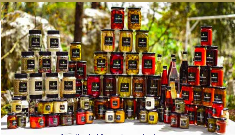
Ayadina's Mouneh product range

We enlisted the help of our IRSHAD team in collaboration with the Farmer-to-Farmer (F2F) Program Land O'Lakes Venture 37 to uplift Ayadina's branding and labeling so that it can compete in international markets. We also helped it secure linkages with local suppliers of raw materials to meet its expanding production needs. We look forward to continue working with Ayadina and other SMEs and witness their expansion in promising directions in the future!