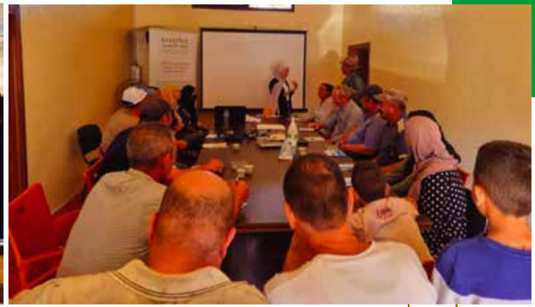
GNFF field engineers delivering trainings to pilot farmers